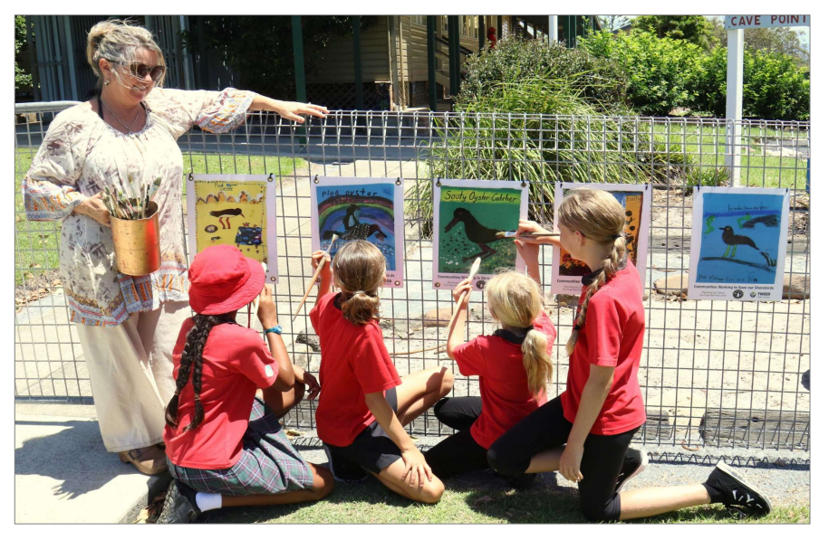
TBLALC, Tweed Landcare Inc and FHC

Birds Eye View – A local shorebirds program with TBLALC, Fingal Head Public School Local Artists, Birding Australia and Tweed Shire Council