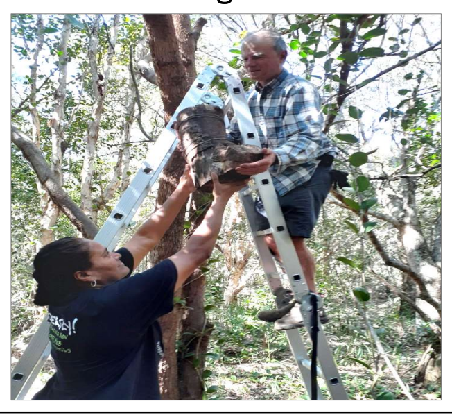
TBLALC Rangers working with Tweed Shire Council and Coastcare in feral fox control