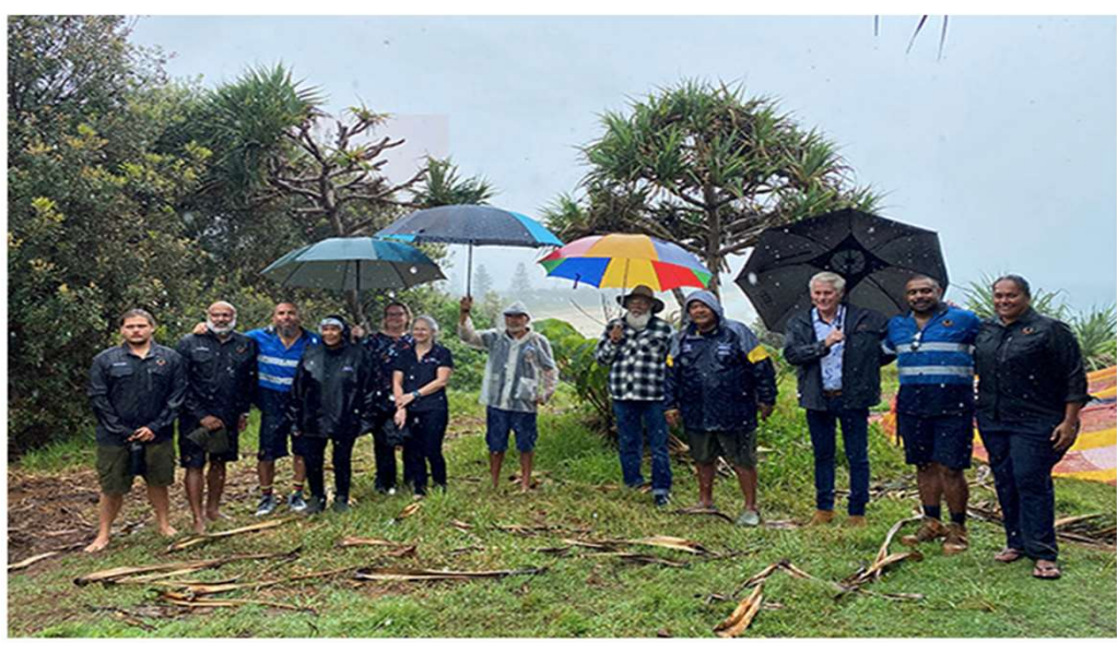
New TBLALC Indigenous Rangers